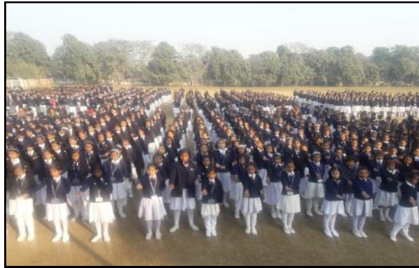
Swachhata pledge by students and staffs