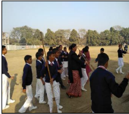
Cleanliness drive by selected students