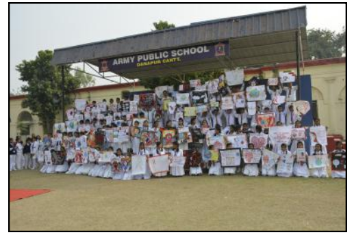
Poster display by students of CI X