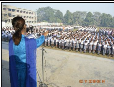
Oath taking by teachers and students