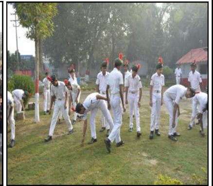
Cleanliness drive by NCC Cadets