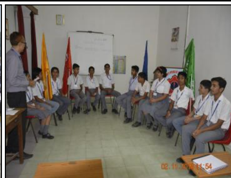
Inter House Quiz Competition.