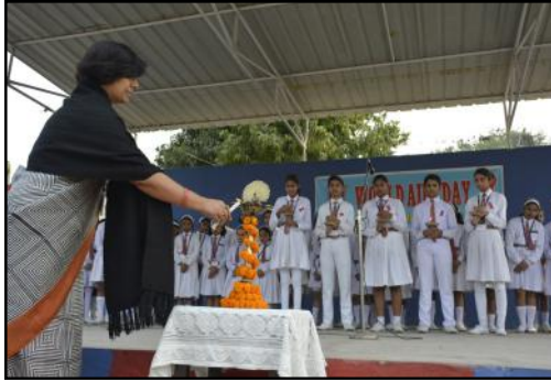
Lighting of Lamp